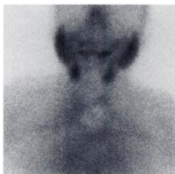
FIGURE 1. Initial TcO4 image shows mild uptake and thyroid enlargement, with the right lobe more than the left.

On the other hand, iodine-induced thyrotoxicosis, or Jod-Basedow disease, occurs in endemic or nonendemic regions (18). Most of the patients have multinodular goiter. The elevated thyroglobulin before treatment (Table 1) in our patient may indicate this, or thyroid adenoma, with autonomously functioning tissue that transports iodine poorly. Thyrotoxicosis