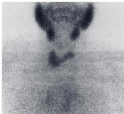
FIGURE 2. Follow-up TcO4 thyroid image shows increased uptake, further reduction in thyroid size and more homogeneous uptake.

will occur several weeks or months after receiving pharmacologic doses of iodine containing radiographic contrast agents or iodine containing drugs or inorganic iodide. Serum iodine concentration must increase sufficiently so that enough iodide can enter the thyroid to allow excessive thyroid hormone synthesis and secretion by autonomous thyroid tissue. Serum thyroglobulin is also increased, in most cases, with thyrotoxicosis (19).