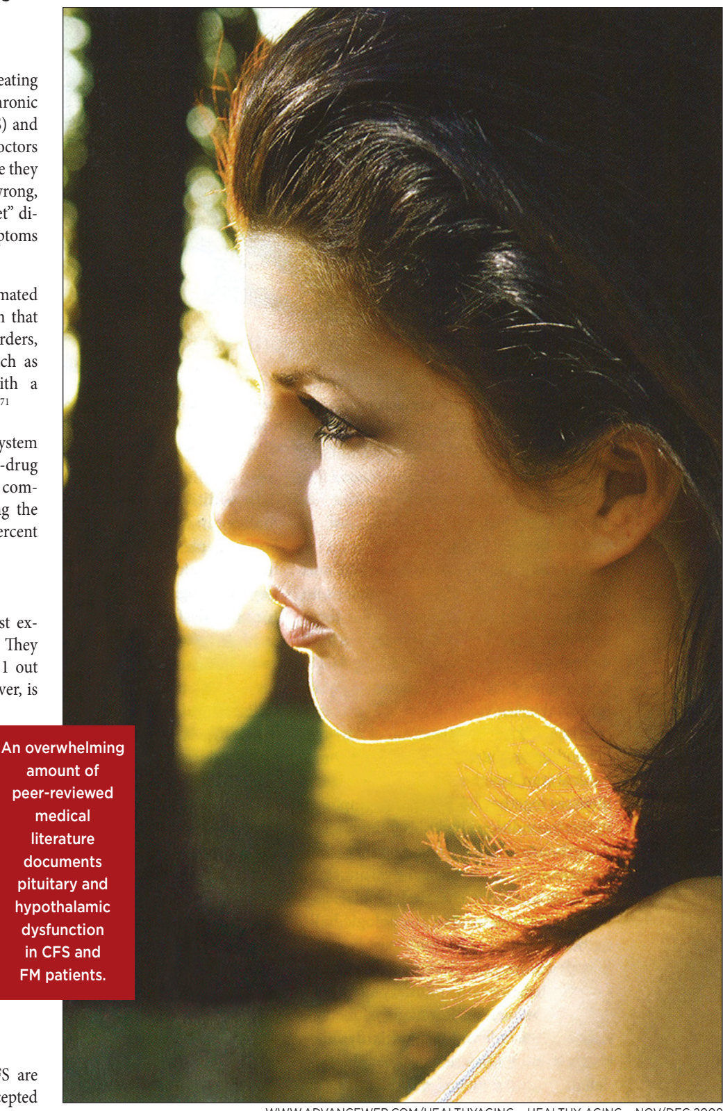
WWW.ADVANCEWEB.COM/HEALTHYAGING • HEALTHY AGING • NOV/DEC 2008

The diagnostic criteria for FM and CFS are limited. Furthermore, there's no accepted